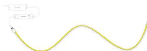
Optical test Diagram